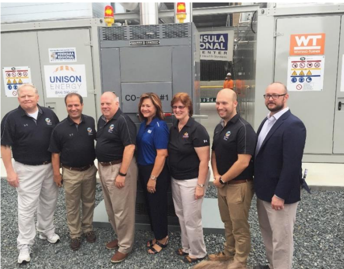
Governor Larry Hogan with Peninsula Regional Medical Center president and the MEA Team at 3.2 MW CHP plant