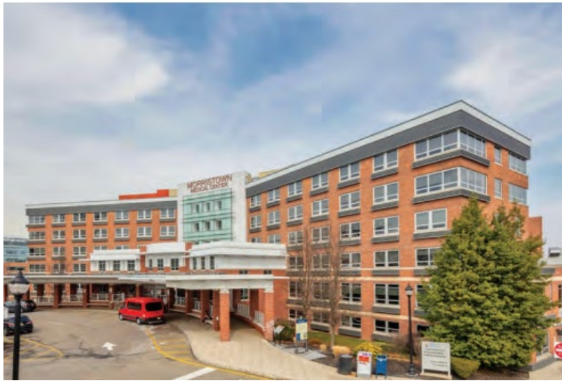
Morristown Medical Center