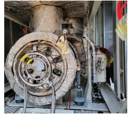
Solar Mercury 50 Turbine installed at Morristown Medical Center

The CHP project was completed as a portion of the hospital's larger electrical infrastructure upgrade projects. This included the extensive onsite work described above in addition to the utility modification of the Madison Avenue feeder so that it is served from a separate substation. This work resulted in two independent utility feeds served by separate substations as well as the onsite generation resource. This significantly reduced the hospital's risk of extended power outages.