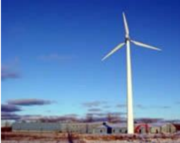
Harbec Plastics in Ontario, NY